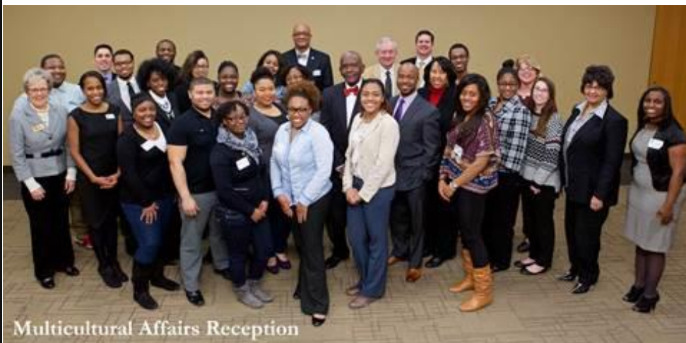
Multicultural Affairs Reception