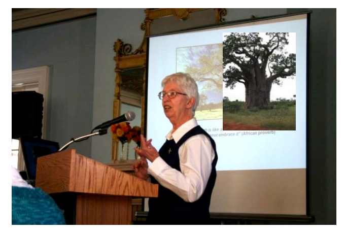
"Truth is like a baobab tree: one person's arms cannot embrace it." (African Proverb)